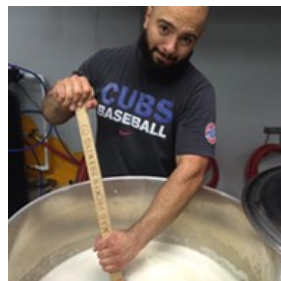
Beer for a Cause: Float the Kegs for MS Jun 22, 2016