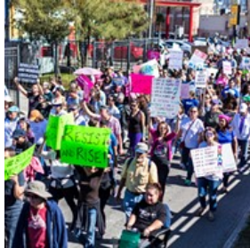
Regional Political Group Will Host San Antonio Women's Rally Jan 13, 2018