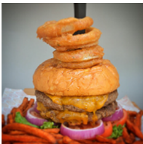
8 Food Challenges to Conquer in the Alamo City Jun 21, 2016