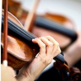
Rejoice! The San Antonio Symphony Is Back for the Season Jan 13, 2018